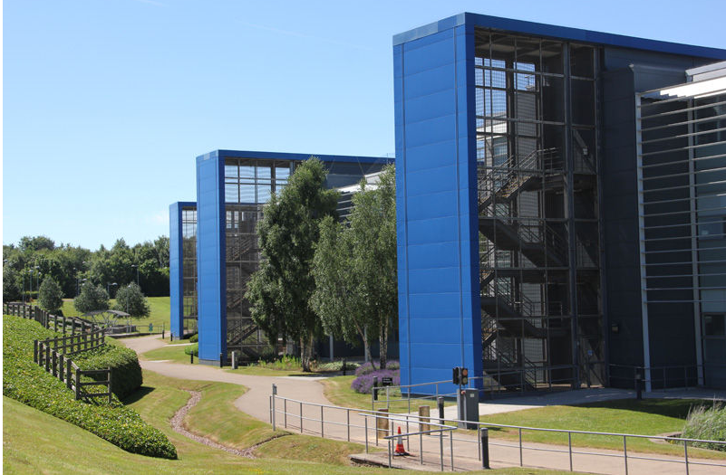
Locker Gladstone PC architectural mesh installed at The Met Office in Exeter.

Gladstone PC 100/10 architectural mesh was used for external staircase cladding.