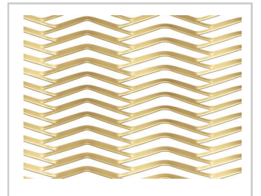
Material: Malin Expanded Metal

The sculptures were a challenging puzzle to install however our skilled rigging team completed the work ahead of schedule over 21 continuous nights.