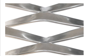
Material: Broadway Expanded Metal

The same Broadway mesh pattern is also used internally as an aesthetic screening around rooflights.