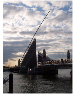
Stockton Architectural Wedge Wire installed as walkway grating on the Twin Sails Bridge, Borough of Poole, Dorset.