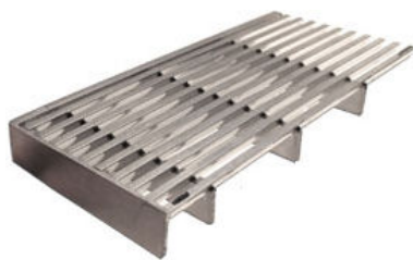
Material: Stockton Architectural Wedge Wire